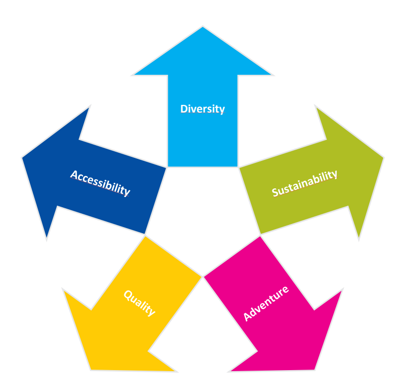
Figure 1. Key positioning attributes

Key positioning attributes are presented on the Figure 1. below.